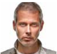
Cristobal Serrano (Spain), Wildlife photographer www.cristobalserrano.com