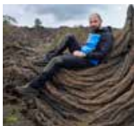
Salvo Orlando (Italia), Wildlife photographer www.sicilylandscape.com